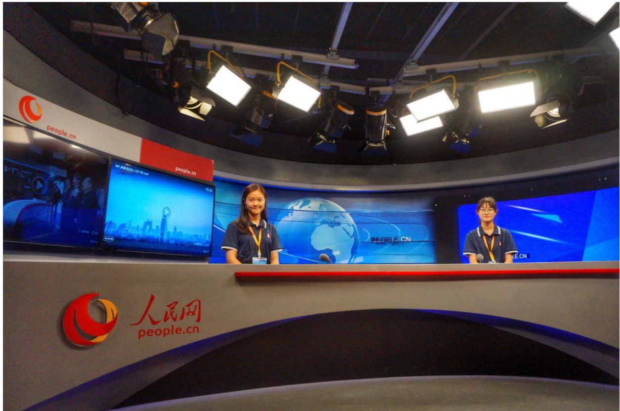
P006: Every delegate has a taste of anchoring a newscast at a broadcasting room of the People's Daily.