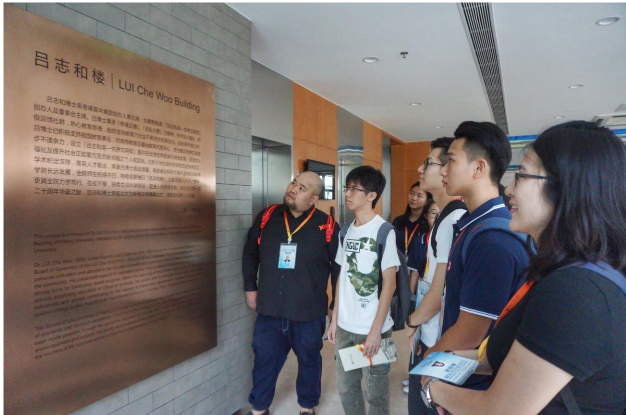
P005: Some delegates study the history of the Lui Che Woo Building to better understand Dr. Lui Che Woo's work promoting educational excellence in China.