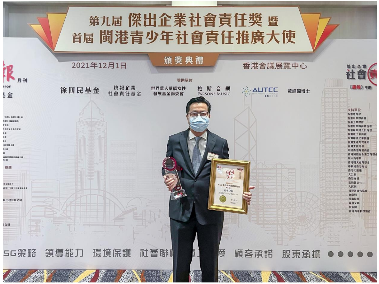
P002: GEG's subsidiary K. Wah Construction Materials Limited also obtained the Outstanding Corporate Social Responsibility Award.