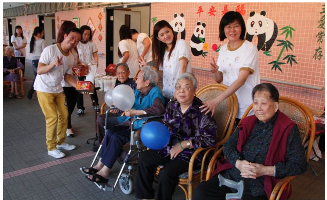
P001: The GEG volunteers shared a wonderful afternoon of activities and good company with the senior residents.