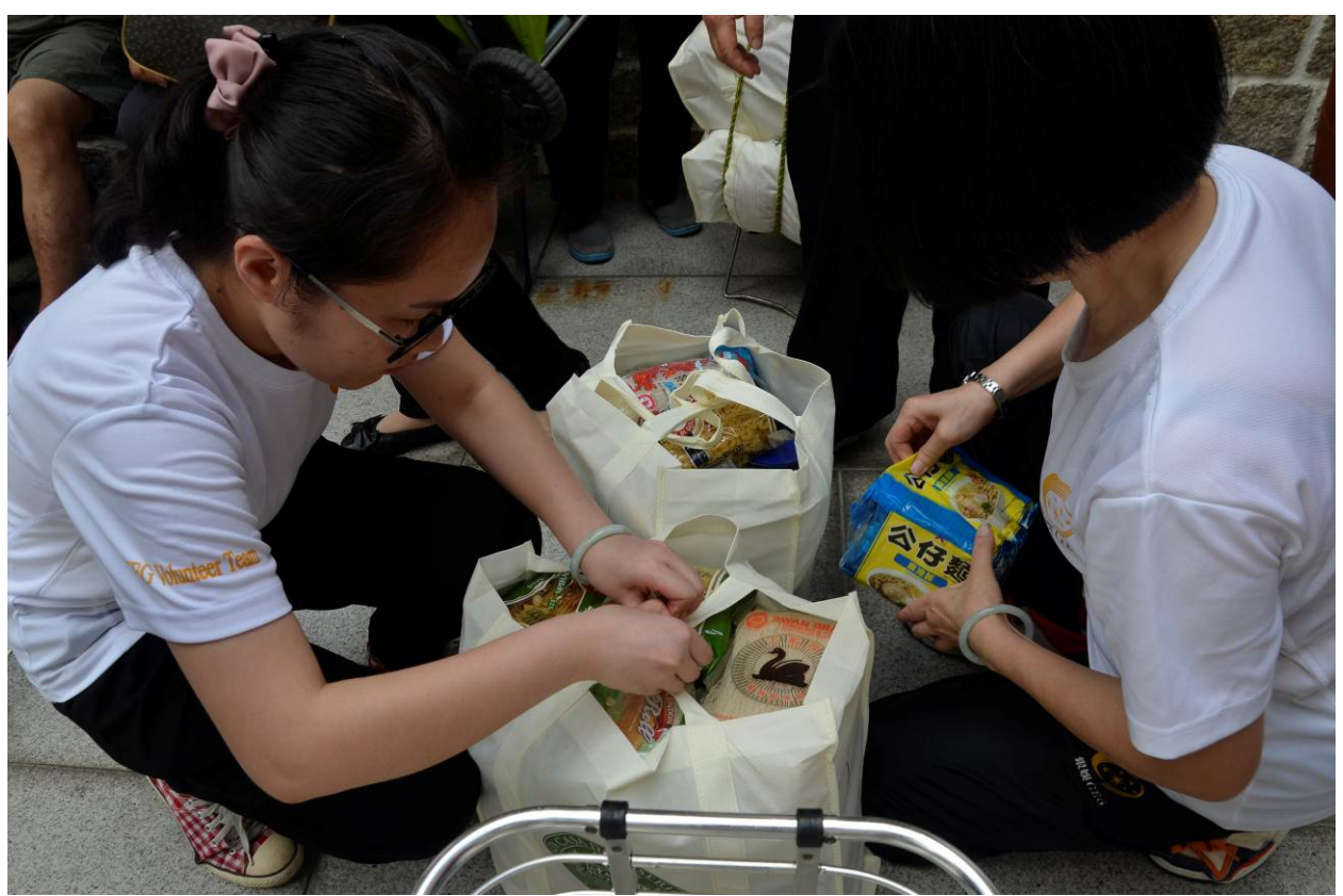
P003: GEG volunteer team members helped to pack food hampers.