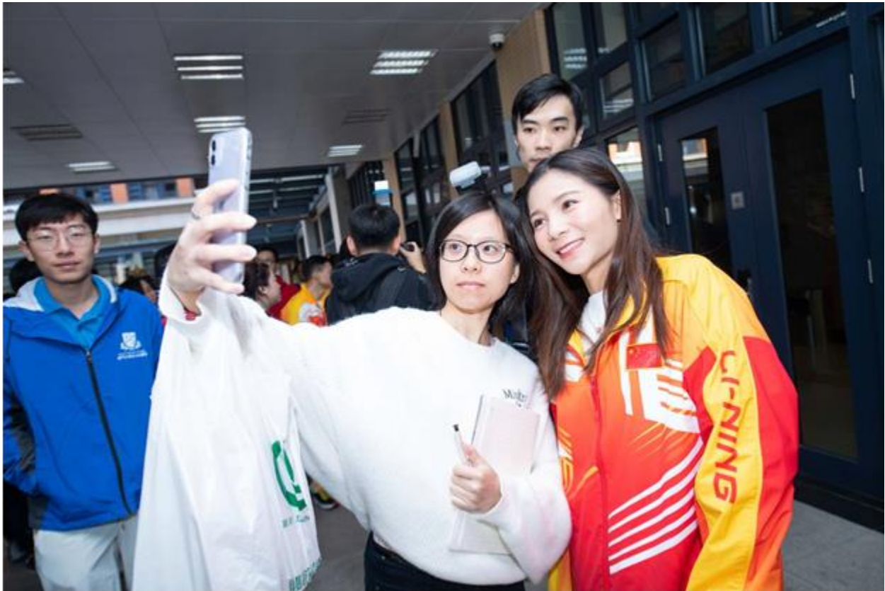
P003: The gold medalist and students took a photo before the sharing session.