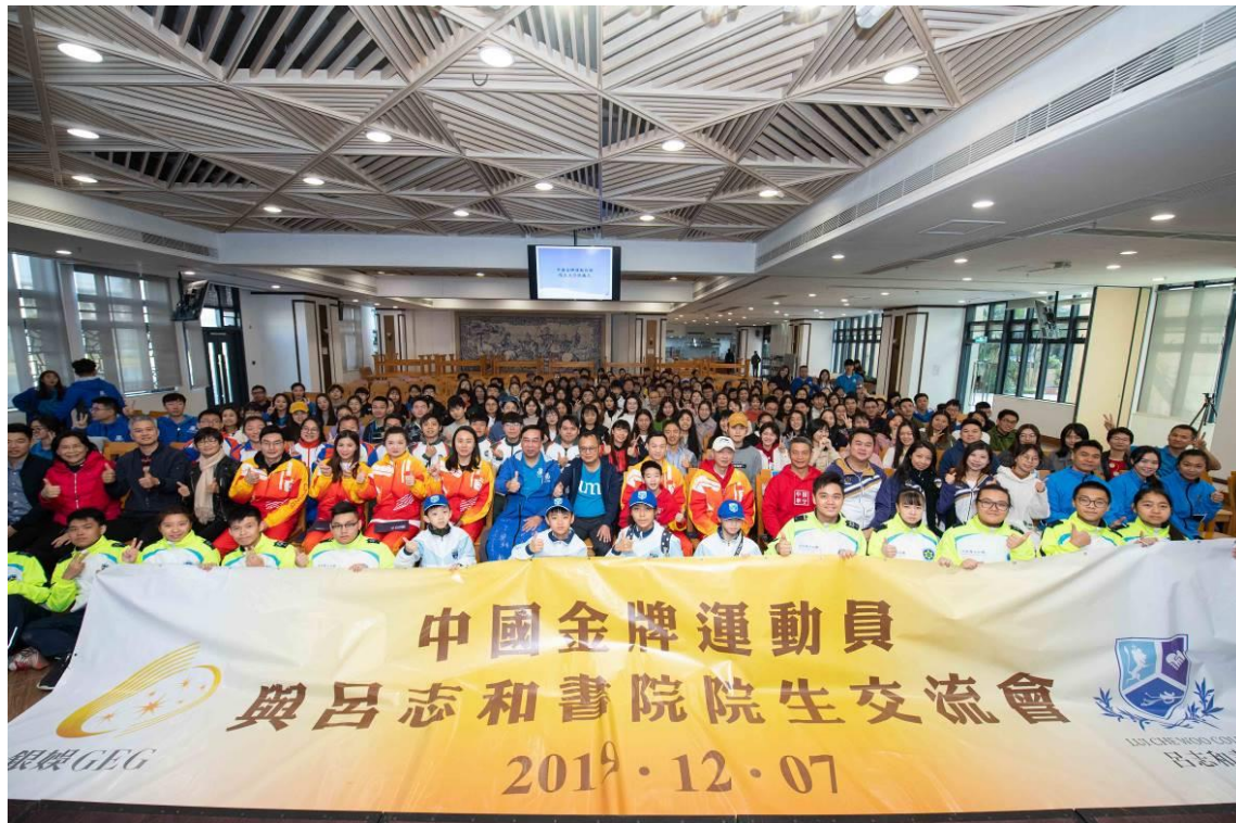
P002: The seven gold medalists shared their experiences with nearly 300 students of Lui Che Woo College amid an exuberant atmosphere.