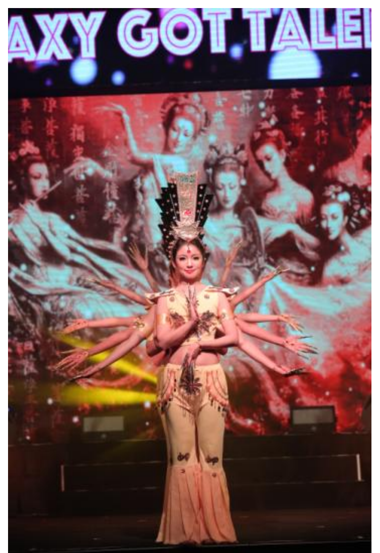
P005 : The Best Image Award is presented to Thousand Hands Guan Yin from Galaxy Macau – Hotel Operations.