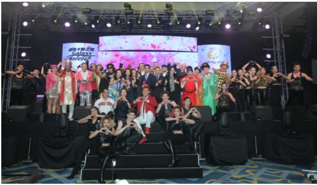
P006 : GEG management team performs on stage.