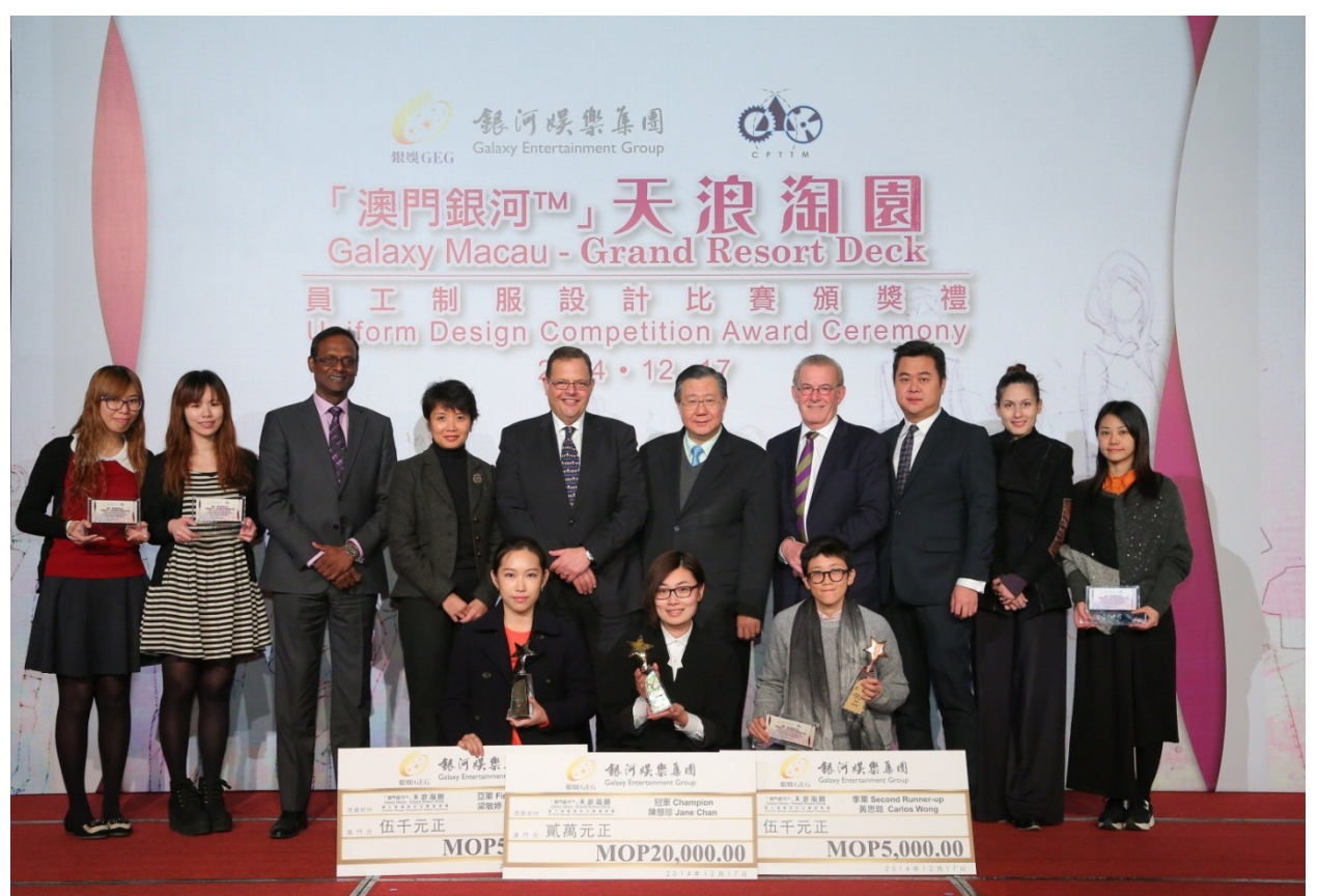
P001 : A group photo of the winning entrants along with guests of honors concluded the ceremony.