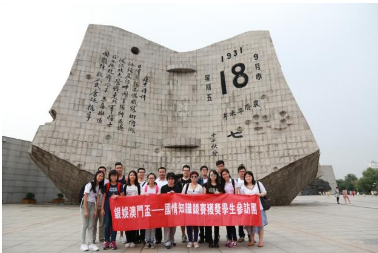
P002: The tour group visited 9.18 Historical Museum to learn about the Sino-Japanese war.