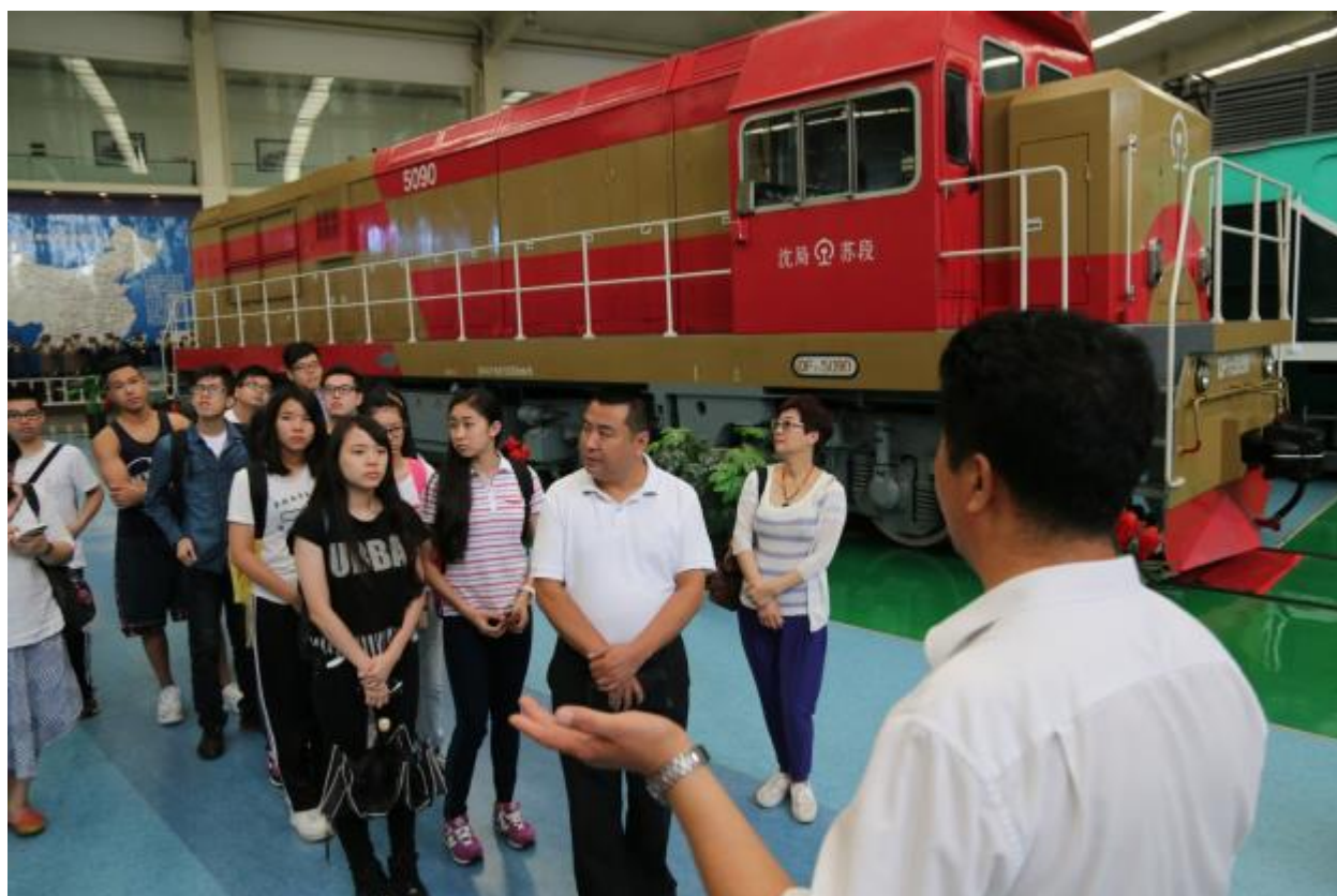
P003: The tour group visited Shenyang steam locomotive exhibition hall for getting an in-depth knowledge about the industrial development of the country.

國情教育(澳門)協會 NATIONAL CONDITIONS EDUCATION (MACAU) ASSOCIATION