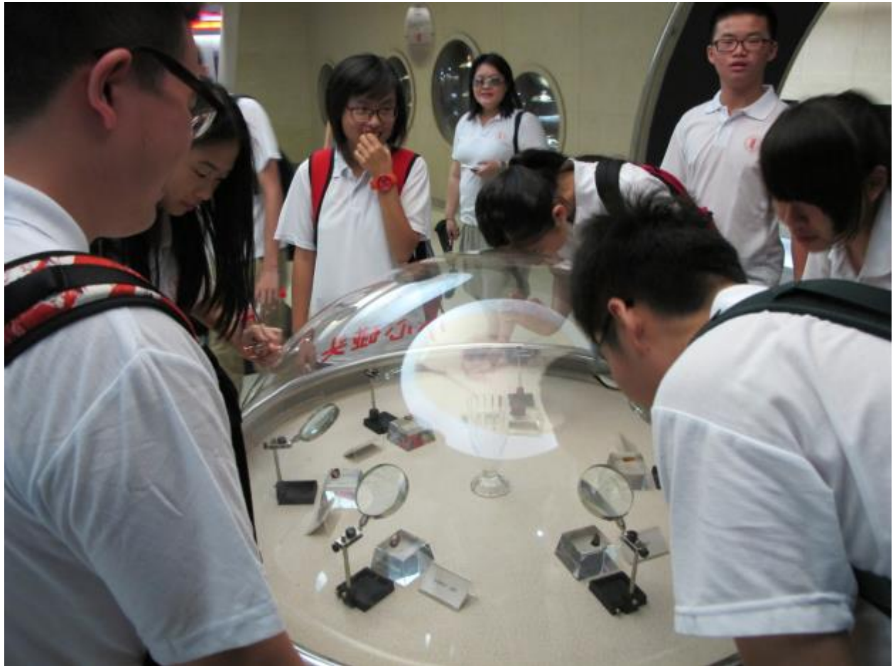
P004 : Students observed the precious ore in the coal mine museum of Fushun.

國情教育(澳門)協會 NATIONAL CONDITIONS EDUCATION (MACAU) ASSOCIATION