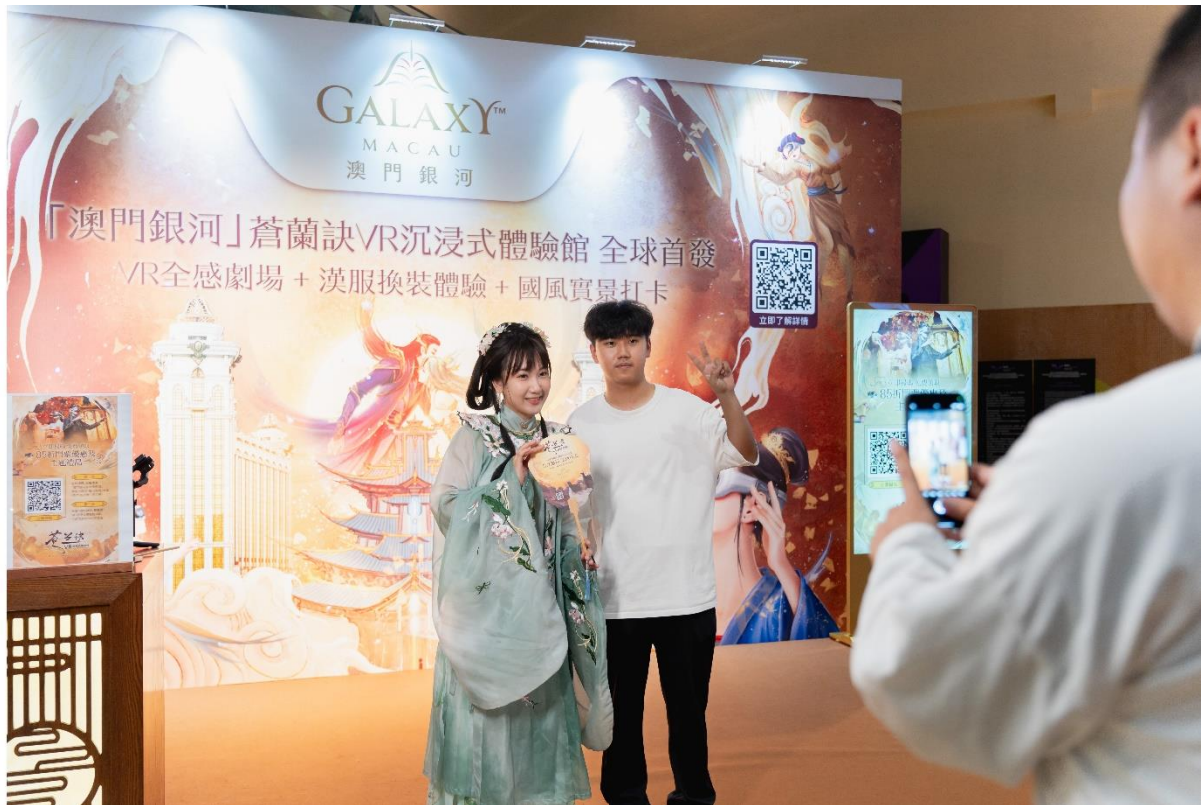
P007: GEG set up the “Love Between Fairy and Devil” immersive VR interactive booth outside the competition venue, to leverage large-scale sports event and link it with themed entertainment and traditional Chinese art and other leisure tourism element.