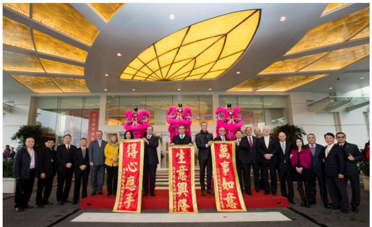
P004: GEG executives wished all citizens and visitors a prosperous Year of the Monkey.