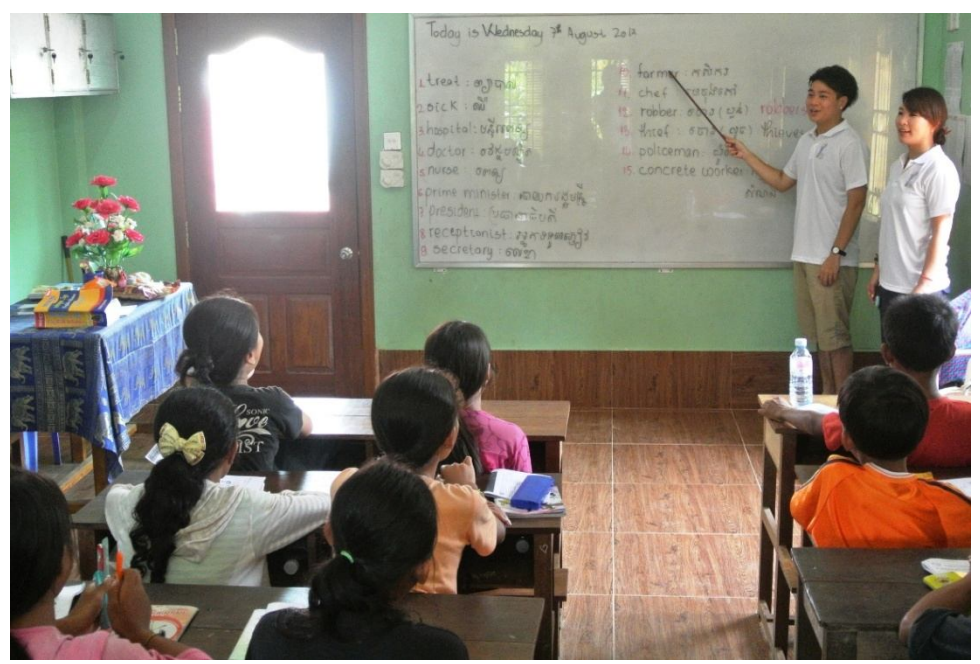
P002: The members specially arranged a fun-filled English lesson for the students at the association.