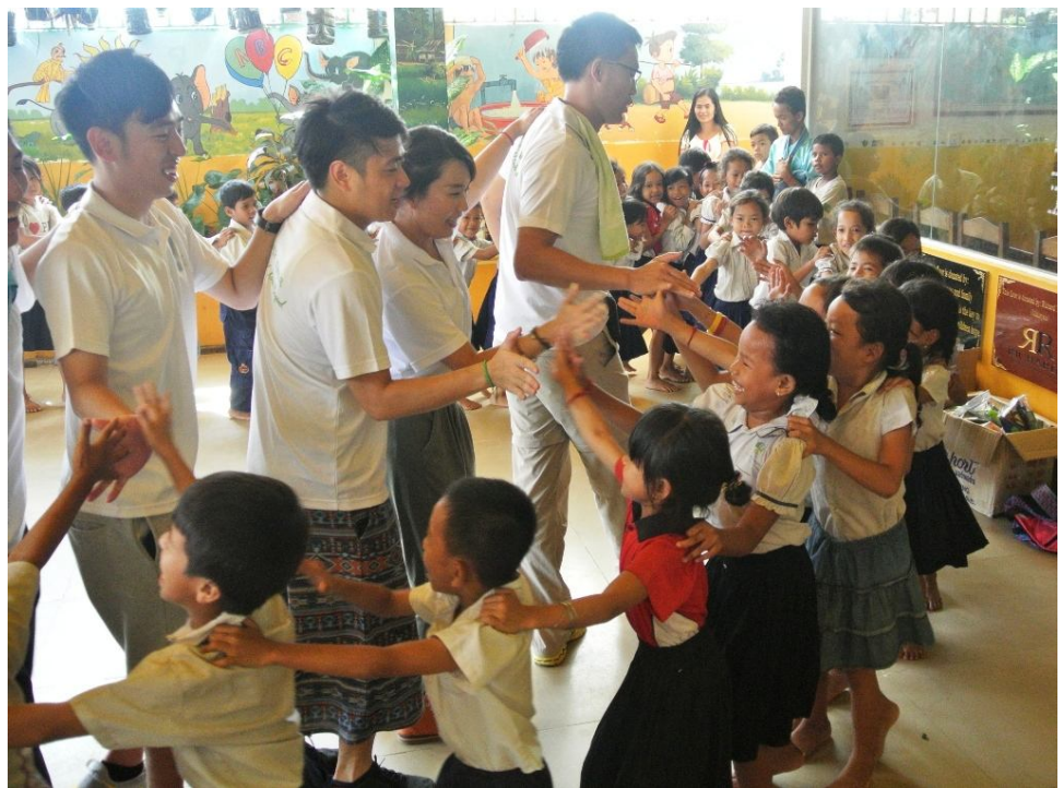
P003: The YAP members brought joy and laughter to the students through some fun games and activities.