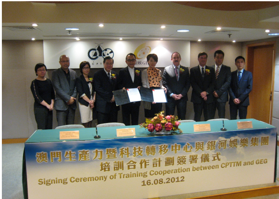
P002: The signing ceremony signified a new milestone in the cooperation between CPTTM and GEG in raising the overall competence of local workforce.