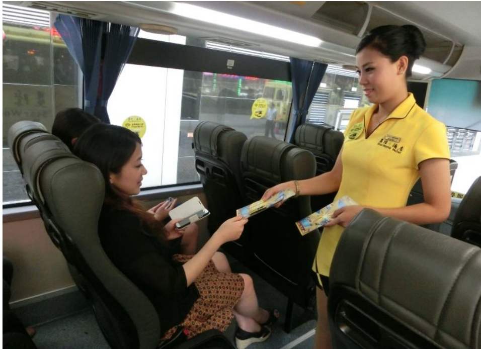
P004: The GEG team member explained to the passengers about the new Wi-Fi service as well as the method to join the lucky draw.