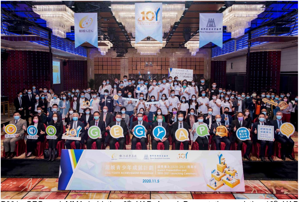
P001: GEG and MMA held the 9<sup>th</sup> YAP Award Presentation and the 10<sup>th</sup> YAP Launching Ceremony today.