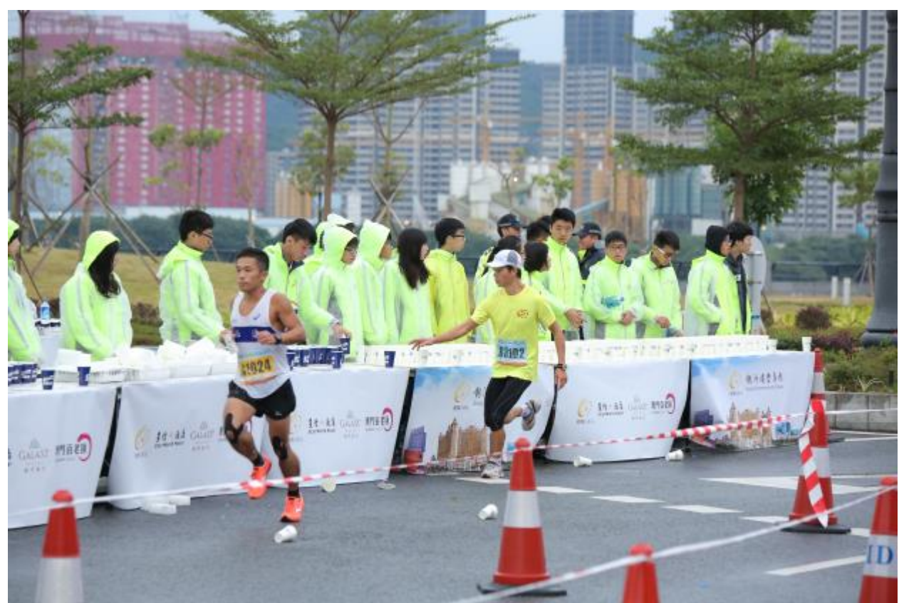
P007: Along the race routes accommodated water stations handing out drinks for athletes passing by.