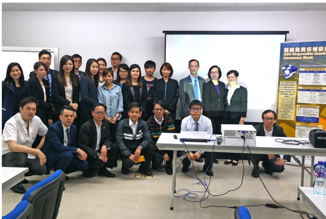
P003: Social workers from Sheng Kung Hui Gambling Counseling and Family Wellness Center conducted a workshop with team members to enhance the knowledge of responsible gaming.