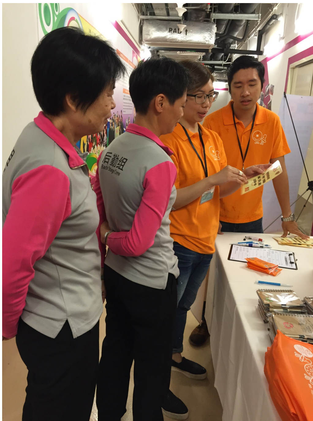
P002: Team members paid close attention to the volunteers who explained the importance of responsible gaming.