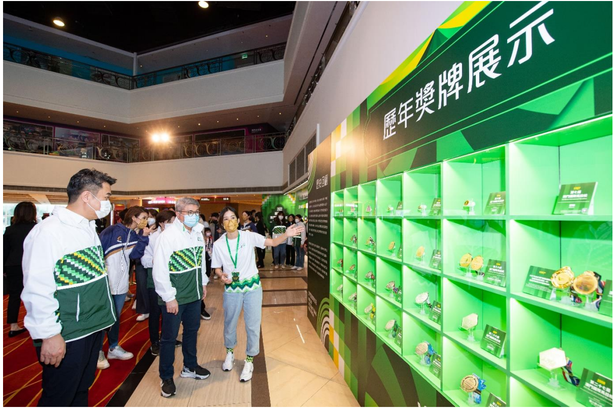
P005: Officiating guests visited the marathon medals exhibition.