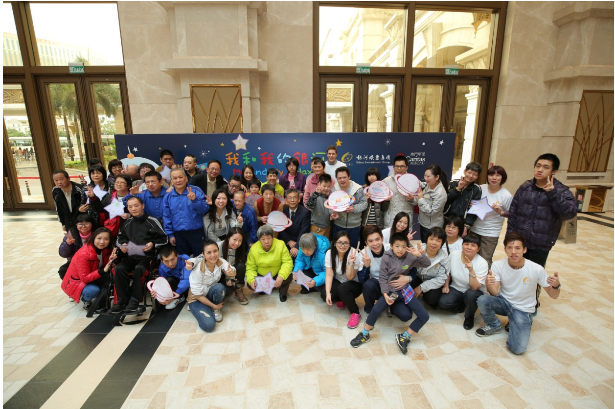
P004: GEG and Caritas Macau held the arts workshop to promote social inclusion.