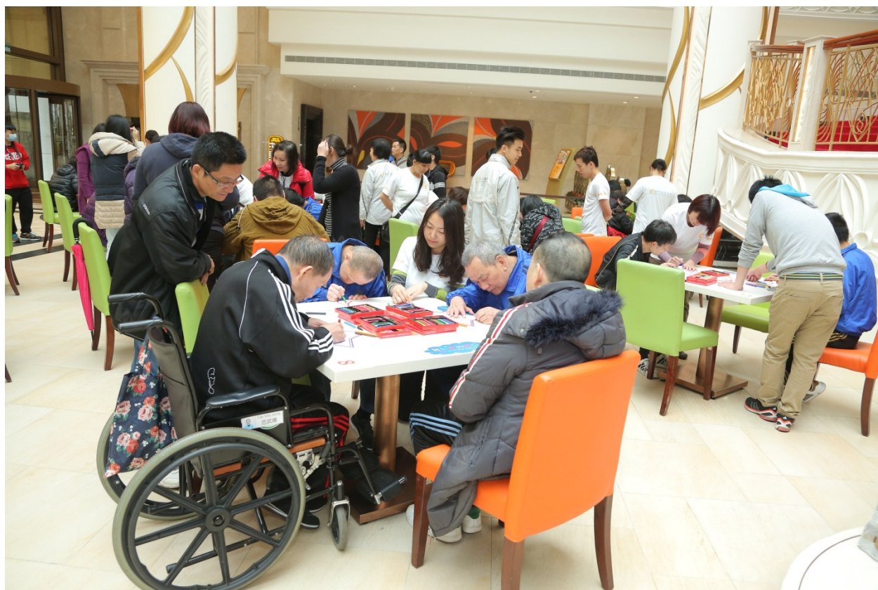
P002: With the attentive help from the GEG volunteers, members from five rehabilitation centers under Caritas Macau concentrated on their creations.