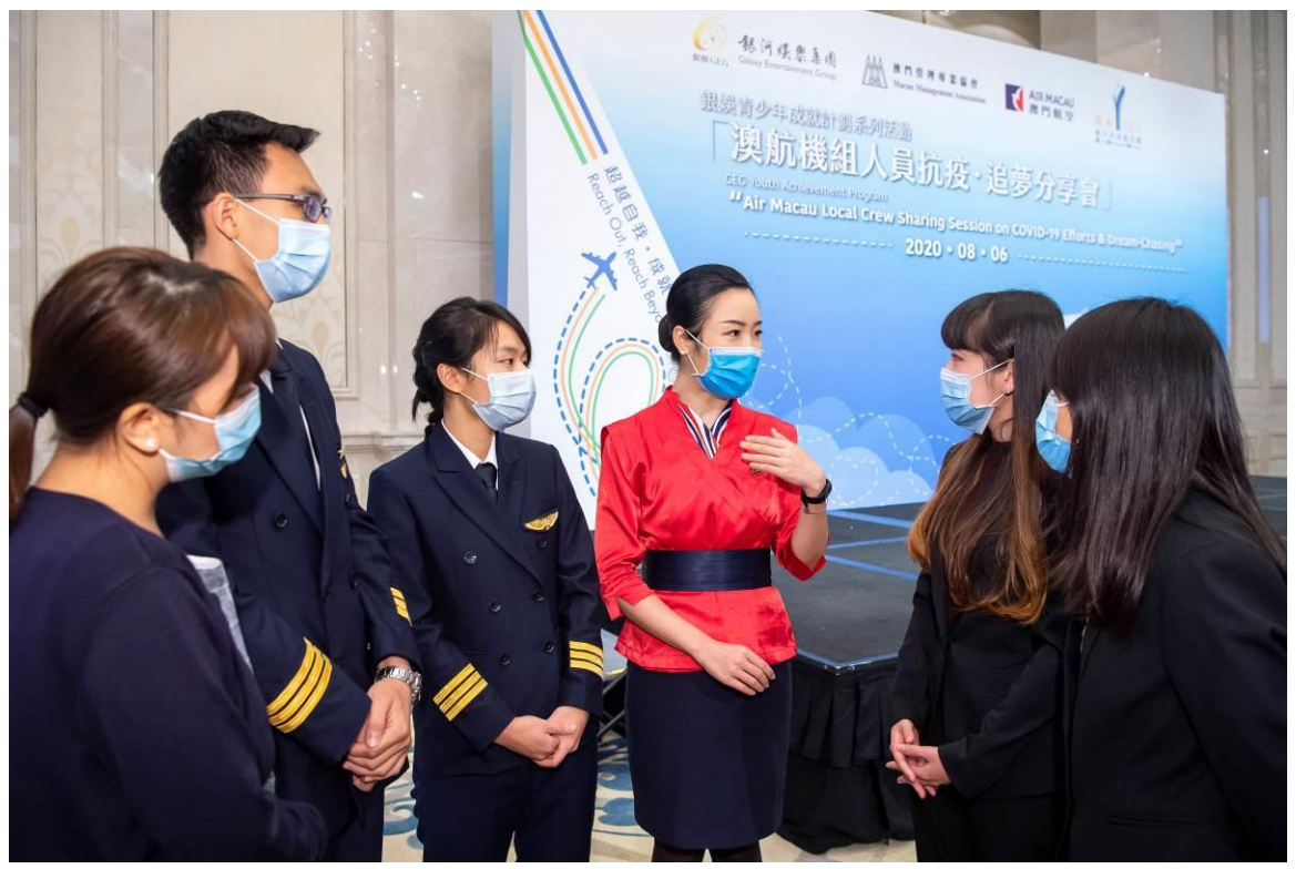
P008: Participants asked Air Macau crew members questions that deepened their understanding of the local aviation industry.