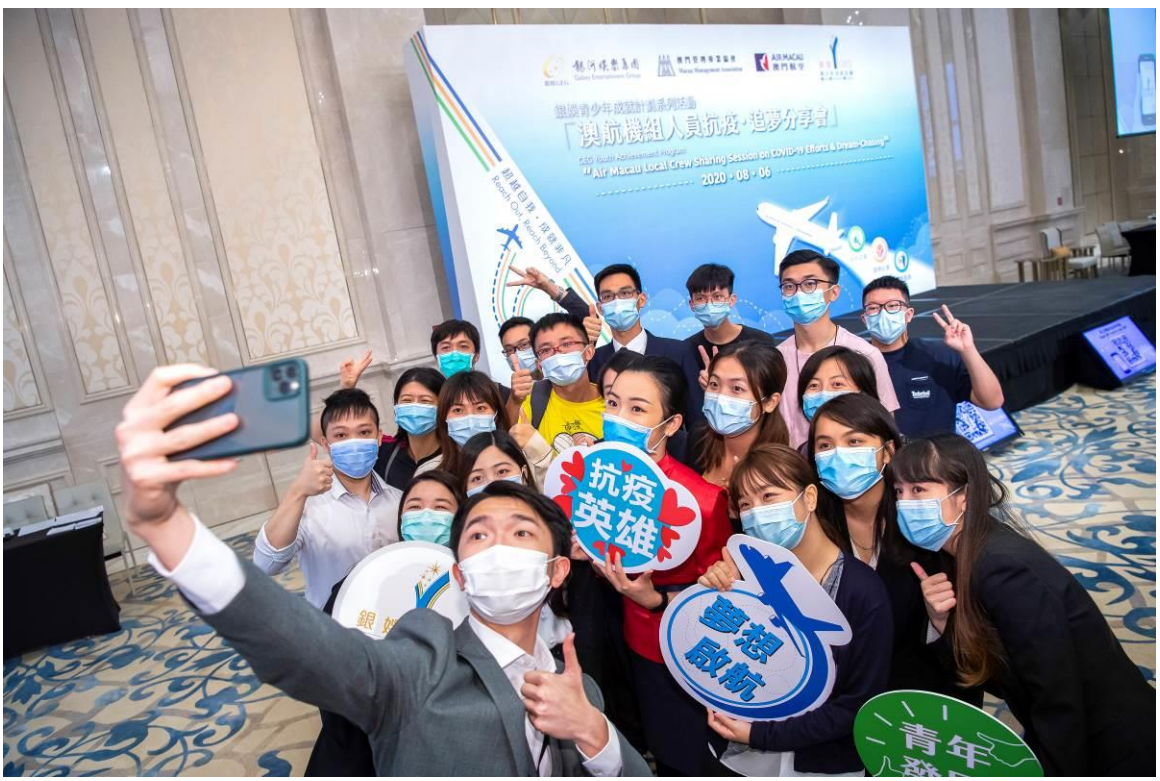
P007: The sharing session attracted more than 120 participants, including current and previous YAP members and interns from the U-LEAD Graduate Internship Program.